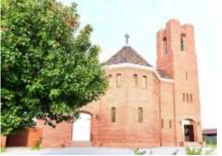
Sketch of St Edmund's Church at Pangbourne Street, Wembley ( The West Australian , 26 June 1954, p.20), and as-built view (https://www.stedmunds.org.au/history)